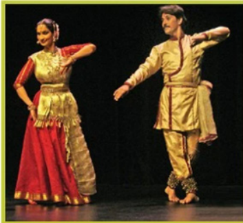
Kathak (From Uttar Pradesh and Rajasthan)