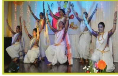
Jhakri from Maharashtra